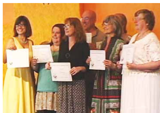
Practical Mysticism class, Spring 2010

Bookstore hours: Wednesdays 11 A.M. - 2 P.M. & 4:30 P.M. - 7 P.M. Thursdays 11 A.M. - 2 P.M. Saturdays 11 A.M. - 2 P.M. Sundays 10 A.M. - 12 Noon Also open Friday June 4, 5 P.M. - 7 P.M.