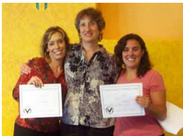
Practitioner I class, 2009 - 2010