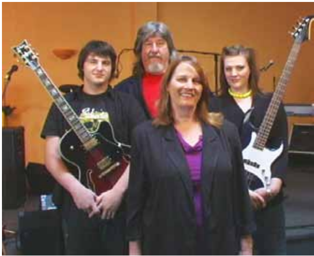
Inspirational Music by Onefold every Sunday