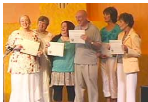
The Power of Your Word class, Fall 2009