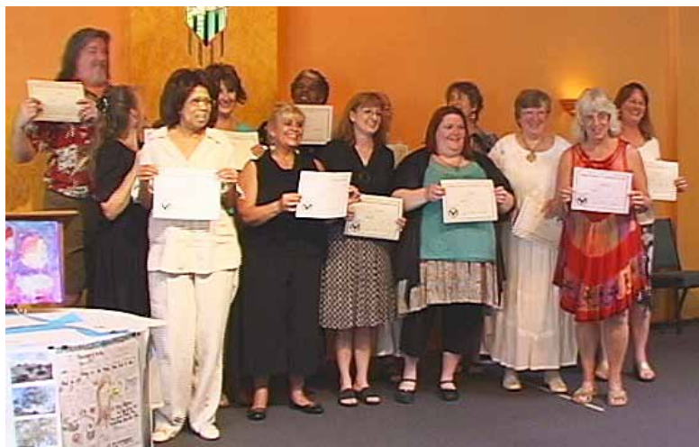
Beyond Limits classes, Summer 2009 - Spring 2010