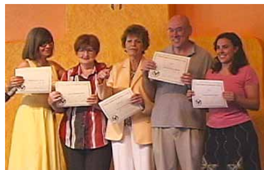
Roots class, Summer 2009